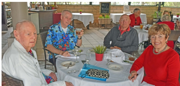
St. Valentines Day Lunch with the Romeo Men and their Valentines at Andiamos! Feb 14, 2017