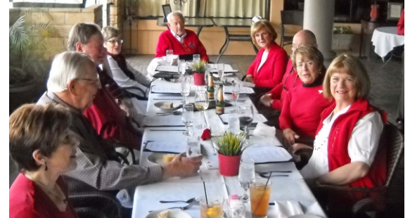
All the Ladies got a Rose